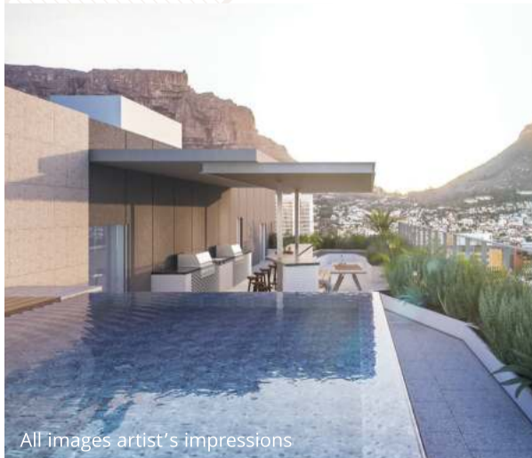
All images artist's impressions